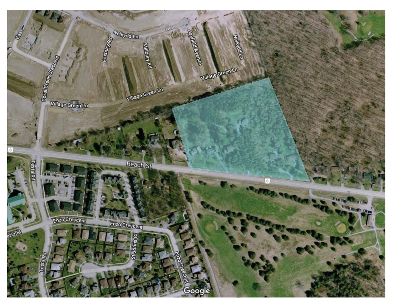
Figure 1: Key Plan