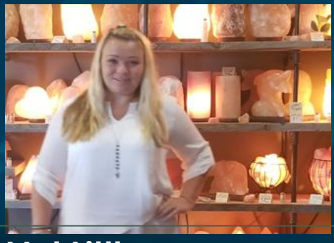
Val Little Holistic Salt Therapy & Cave