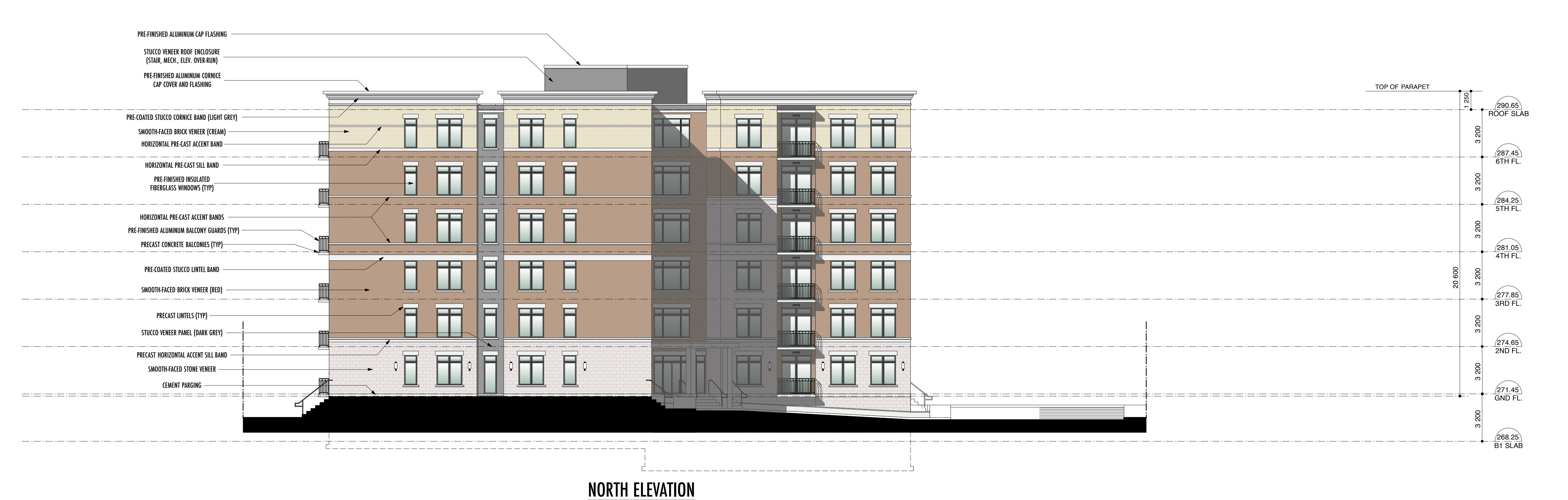
PRE-FINISHED ALUMINUM CAP FLASHING STUCCO VENEER ROOF ENCLOSURE (STAIR, MECH., ELEV. OVER-RUN) PRE-FINISHED ALUMINUM CORNICE CAP COVER AND FLASHING TOP OF PARAPET 290.65 ROOF SLAB PRE-COATED STUCCO CORNICE BAND (LIGHT GREY) SMOOTH-FACED BRICK VENEER (CREAM) - HORIZONTAL PRE-CAST ACCENT BAND HORIZONTAL PRE-CAST SILL BAND PRE-FINISHED INSULATED FIBERGLASS WINDOWS (TYP) HORIZONTAL PRE-CAST ACCENT BANDS PRE-FINISHED ALUMINUM BALCONY GUARDS (TYP) PRECAST CONCRETE BALCONIES (TYP) 281.05 4TH FL. PRE-COATED STUCCO LINTEL BAND 277.85 3RD FL. —PRE-FINISHED ALUMINUM CAP FLASHING - SMOOTH-FACED BRICK VENEER (RED) - PRECAST CORNICE BAND - PRECAST LINTELS (TYP) SMOOTH-FACED STONE VENEER - STUCCO VENEER PANEL (DARK GREY) PRE-PAINTED INSULATED GARAGE DOOR 274.65 2ND FL. PRECAST HORIZONTAL ACCENT SILL BAND - SMOOTH-FACED STONE VENEER - PRECAST ACCENT BAND r-----